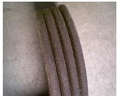
Example of a modified multi V-belt

The modified belts can be used without reserve for the automotive applications specified in the catalog. Despite the optical differences, the new finish has no adverse impact on performance.