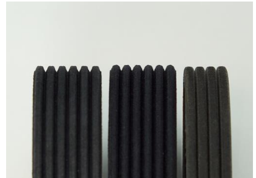
The modified profile section types – difficult to detect with the naked eye