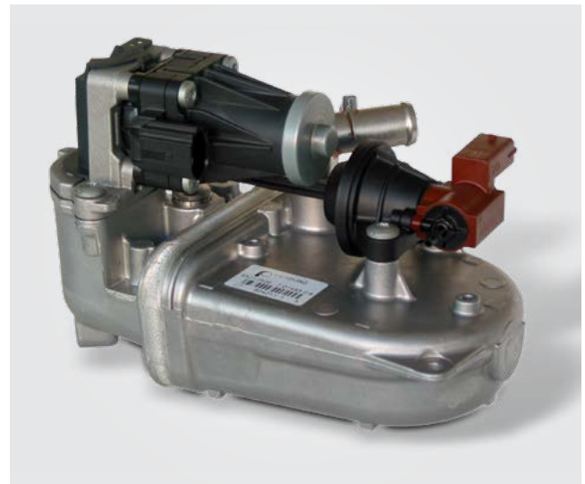
Pierburg EGR cooler module with integrated EGR valve and bypass flap fitted by Fiat and GM