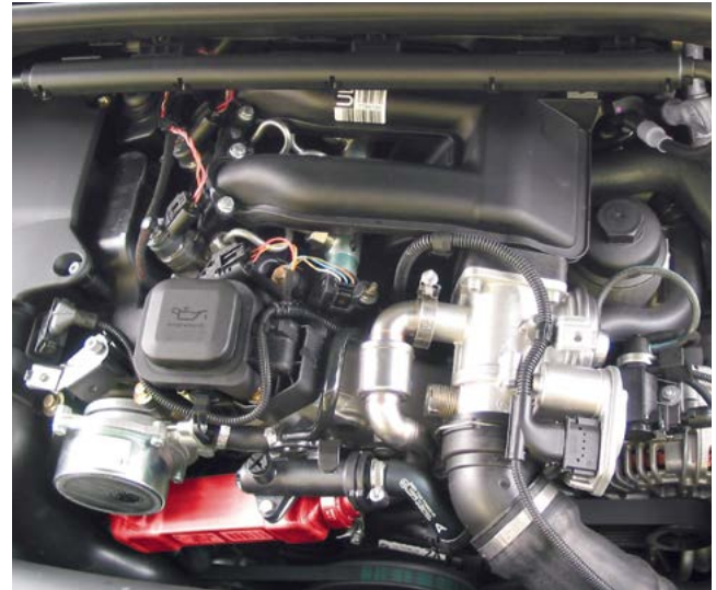
EGR cooler in a BMW 318d (highlighted in red)

The term “nitrogen oxides” is an umbrella term for the gaseous oxides of nitrogen. Use is made of the abbreviation \text{NO}_x , as there are several compounds of nitrogen and oxygen on account of the numerous oxidation stages of nitrogen. Nitrogen oxides irritate and harm the respiratory organs, contribute towards smog and ozone formation and promote the development of acid rain.