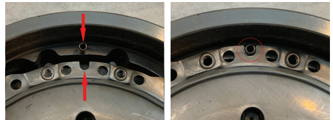
Figure 2: Correct Assembly

If the flywheel isn't aligned properly to the pressure plate the centering pin at the flywheel will bend the pressure plate. Due to this engagement and disengagement problems occur.