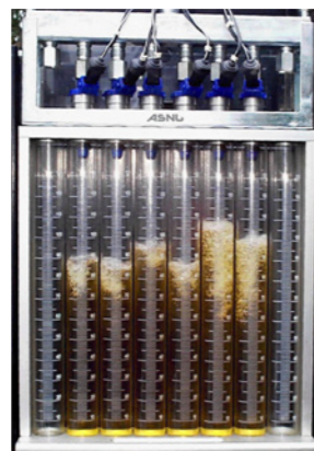
Good Flow: 5 Fair Flow: 1 Bad Flow: 2,3,4,6

Unfortunately impurities from service station refills and corrosion in metal fuel tanks are ever-present and can ruin a modern fuel system. Even the smallest particles can cause damage to an injector pintle causing spray pattern distortion which in turn affects combustion efficiency, fuel consumption, idle stability and emissions.