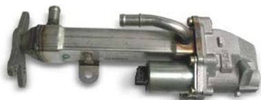
Fig. 1: EGR valve with EGR cooler

To prevent expensive and time-consuming engine repairs when searching for coolant leaks, check for leakage from the EGR cooler before you start to dismantle the engine.